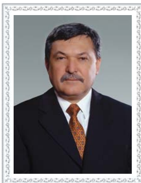
DR. SÁNDOR CSÁNYI Chairman-CEO